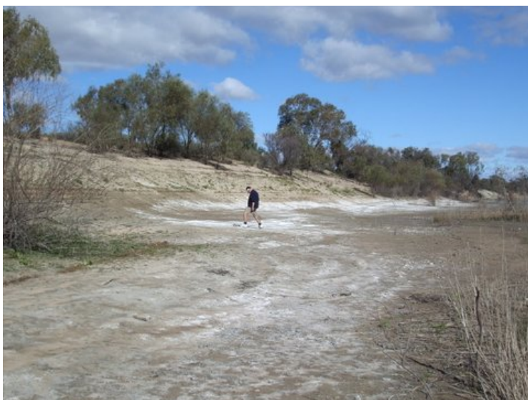
Salt efflorescence on the dry banks of the River Darling about 0.5km downstream of the main weir that forms Lake Wetherell. These may increase salinity of first flush of releases and hence delay utility of the released water for recharging aquifers used as drinking water supplies.