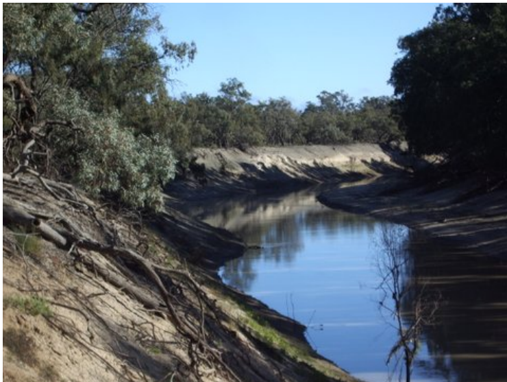
The River Darling further downstream of the Main Weir at the proposed Talyawalka borefield site. Water is pooled at a low level with very low flow rate. Freshwater releases during high flow events would benefit MAR systems as well as the stream environment.