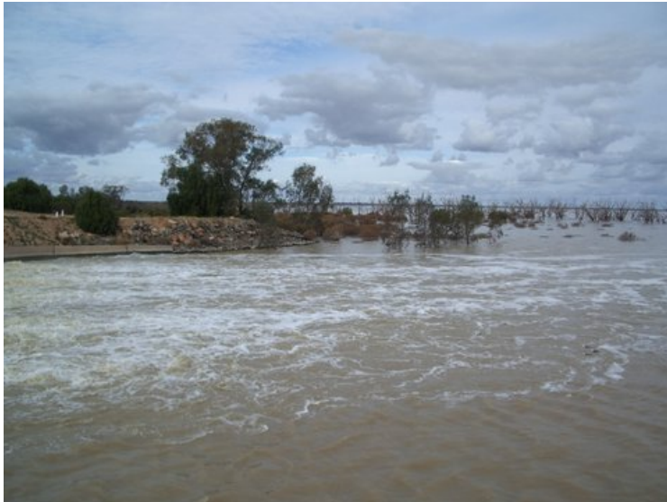
Water diverted by the Main Weir passing into the Menindee Lakes system in June 2010.