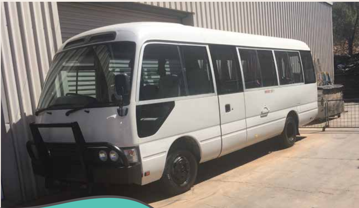
Xtra Mile’s first bus!