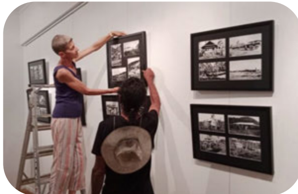
Photos from FRRR grants: https://frrr.org.au/blog/2023/04/26/im-not-afraid-to-talk/ and https://frrr.org.au/blog/2023/04/24/mission-beach-echo-of-the-past/