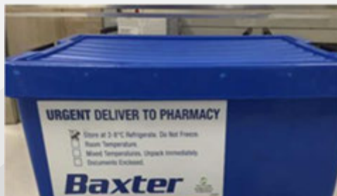
Reusable Tub & Ice Bricks