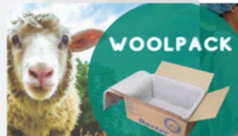
Wool replacing Polystyrene