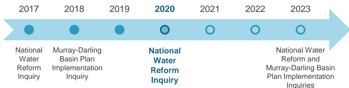
Figure 2 Timeline for Productivity Commission water inquiries

This is the Commission’s second inquiry into national water reform, and represents the sixth assessment of progress against the NWI. (The text of the NWI can be accessed via a link on the inquiry website.)